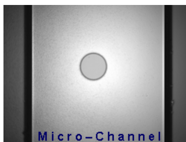
Figure 1: Top view of a microchannel HF-etched in Pyrex bonded on a silicon substrate bearing a 200 \mu\text{m} in diameter silica microdisc.